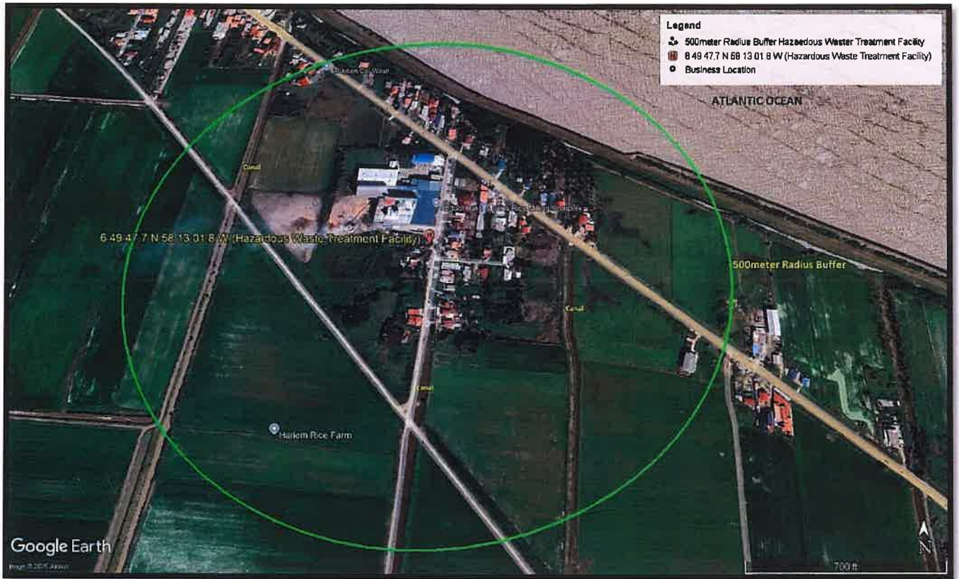
Figure 1: Google map of the Project Location