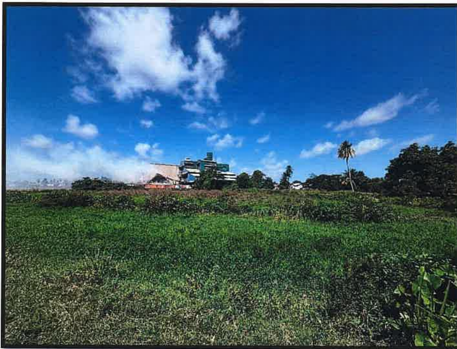
Figure 2: Current condition of the project location