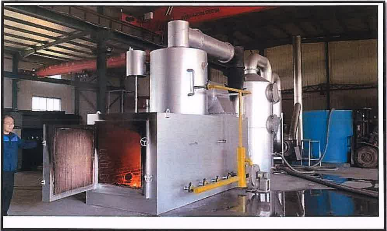
Figure 5: Incinerator