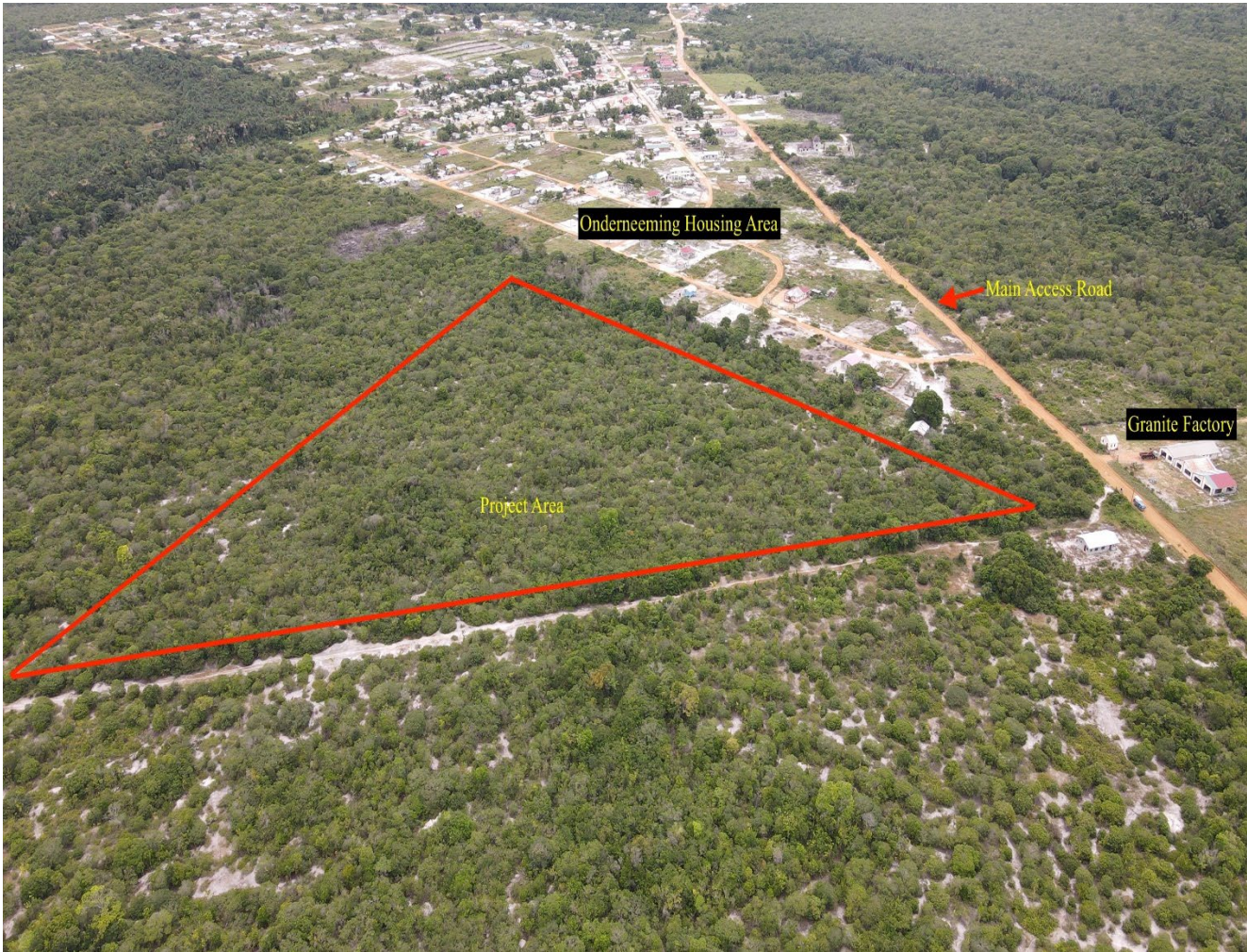
Map Showing the Onderneeming Project area

There are no plans for further site expansion as there is an established road for access.