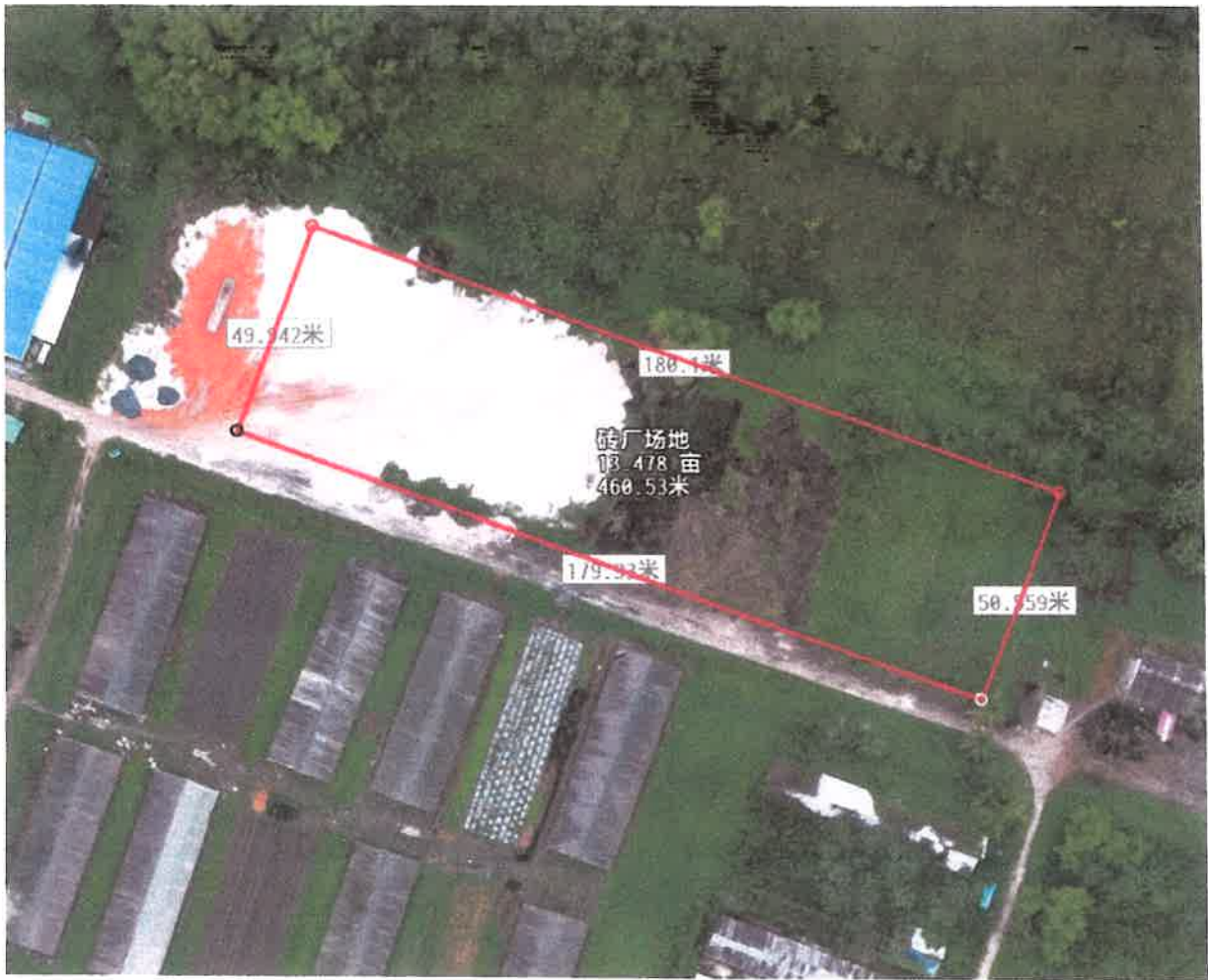
Figure 2: Image depicting Google satellite imagery of the proposed block making plant's location