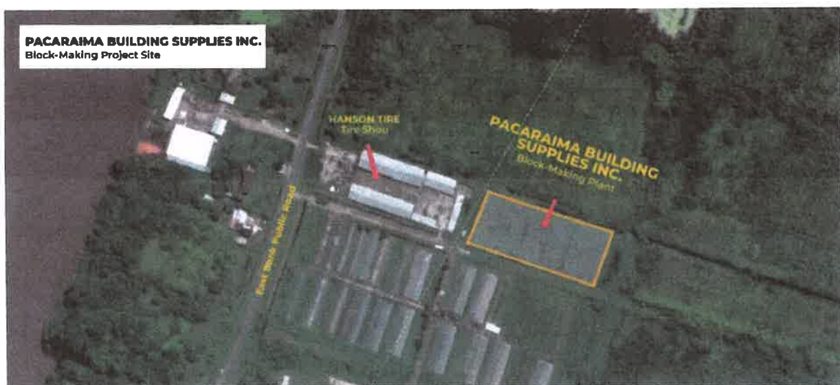
Figure 1: Image depicting Google satellite imagery of the proposed block making plant's location

The topography of the area is generally flat with clayey soil. The area is built up, with an earthen drain at the northern perimeter to drain the land. The surrounding land use is a mix of industrial and naturally vegetated areas. The land is bounded to the west by a food-box factory and tire shop, whereas, the east and north adjoining lands are currently unoccupied, and the southern border is bounded by a crop farm.