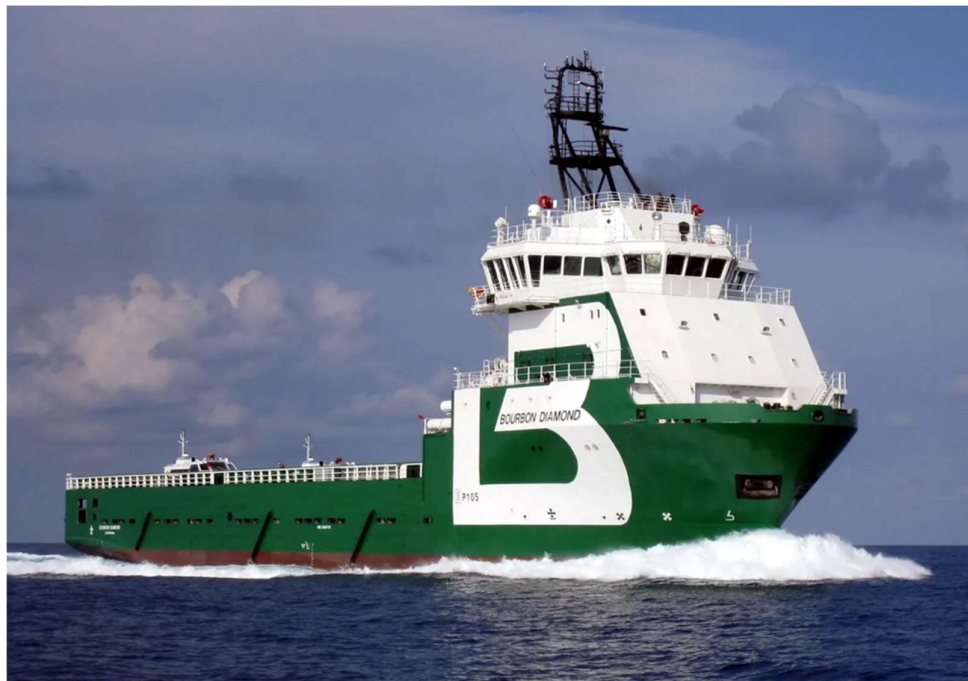
Figure 3 – Bourbon Diamond

Specs of these individual vessels has been provided to EPA in our applications.