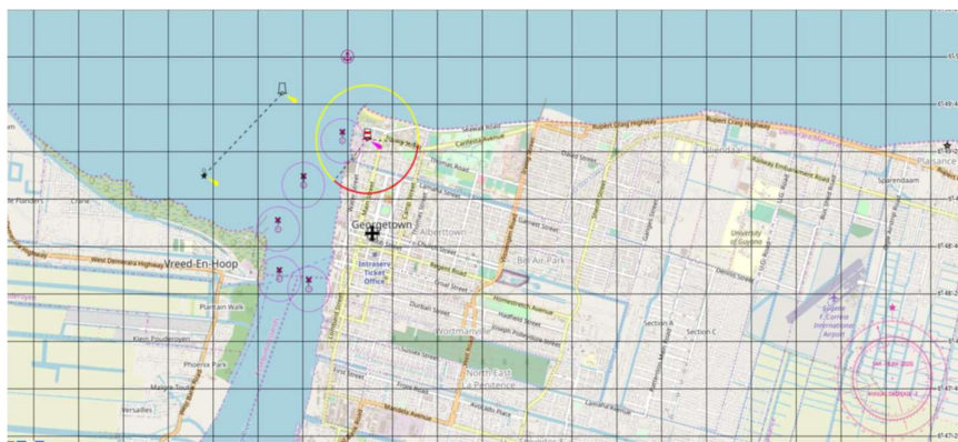
Figure 1 Project Schematic - Georgetown

In this respect Esso Exploration and Production Guyana Limited (EEPGL) and their Contractor Saipem Guyana Inc has requested Bourbon Guyana Inc to provide Offshore Support Vessels to support their Construction Projects ongoing at the projects.