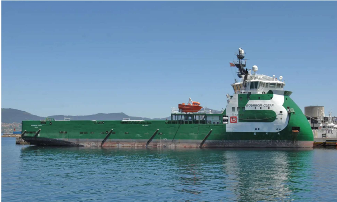
Figure 3 – Bourbon Clear

Specs of these individual vessels has been provided to EPA in our applications.