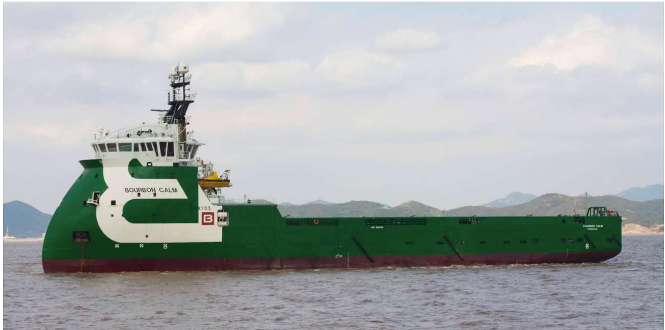
Figure 3 – Bourbon Calm

Specs of these individual vessels has been provided to EPA in our applications.