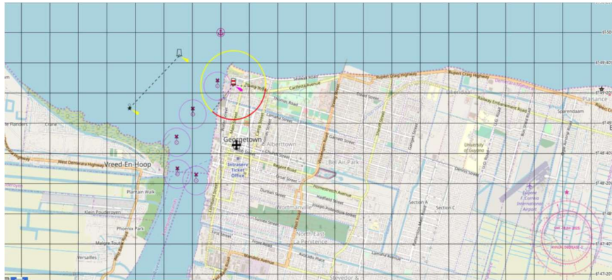
Figure 1 Project Schematic - Georgetown

In this respect Esso Exploration and Production Guyana Limited (EEPGL) and their Contractor Saipem Guyana Inc has requested Bourbon Guyana Inc to provide Offshore Support Vessels to support their Construction Projects ongoing at the projects.