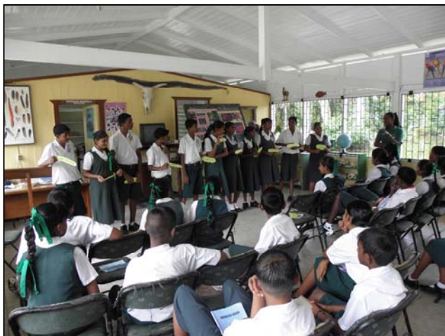
Students participating in Web of Life Activity

agency for environmental and Natural resources management in Guyana, has over the years sought to bring awareness of the value of Wetlands in observance of World Wetlands Day.