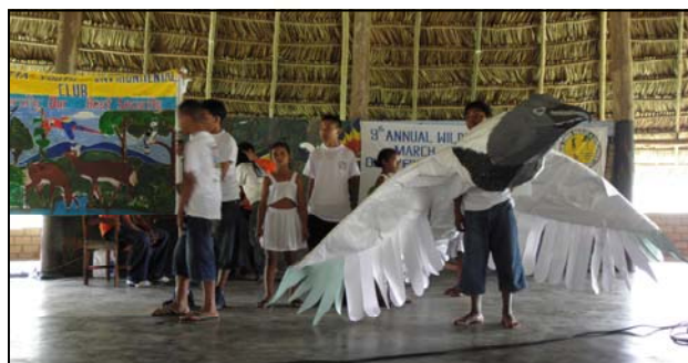
One of the costumes displayed at this year's festival

At this year's festival, Officers from the EPA were involved in organizing and running activities and also served as judges for the best banner and best costume competitions. A formal presentation which highlighted water pollution and conservation was also done.