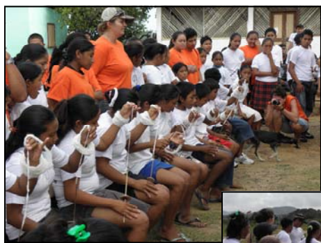
Cotton spinning, archery and cassava grating were some of the competitions at the Festival