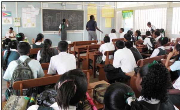
Students from Belladrum Secondary, Fort Wellington Secondary and No. 29 Primary (respectively) participating in World Water Day Outreach

In view of the importance of water to the world, a decision was made to observe World Water Day annually on March 22 internationally. This decision was made at the United Nations Conference on Environment and Development, held in 1992 in Rio de Janeiro, Brazil. World Water Day has since been celebrated annually under various themes, each highlighting an issue of concern about the state of water in our world today.