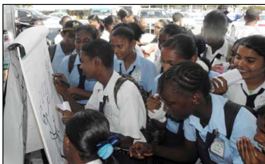
Students participating in Speed Drawing Activity

The Environmental Protection Agency actively participated in the recently held career Day hosted by the University of Guyana. The Agency, in support of the theme of the Fair “Study options and Career Choices for Youth Empowerment”, disseminated information and encouraged interpersonal discussions on career choices within the Agency. Maximum use was also made of the opportunity to spread awareness about the environment, Biodiversity and Climate Change.