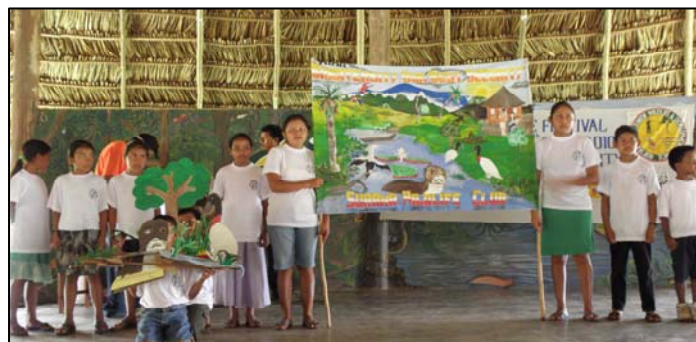
Surama Wildlife Club members displaying their winning Banner

Planning for the Festival began in February when representatives from each Wildlife Club of North Rupununi met to report on the recent club activities. The EPA was integrally involved in this session and now enjoys a stronger relationship both with the Clubs of the North Rupununi as well as with Iwokrama, the coordinator of the Festival. This relationship has led to greater interaction with the Wildlife Clubs of the North Rupununi and has resulted in an increased focus on environmental issues both by the Clubs and within the communities they operate. This year, one of the great achievements was the conferring of Certificates of Affiliation to seventeen (17) Wildlife Clubs. The EPA is optimistic of greater collaboration and being able to make a more dynamic contribution in environmental issues to the hard to reach communities of the Rupununi region through the Clubs functioning in these areas.