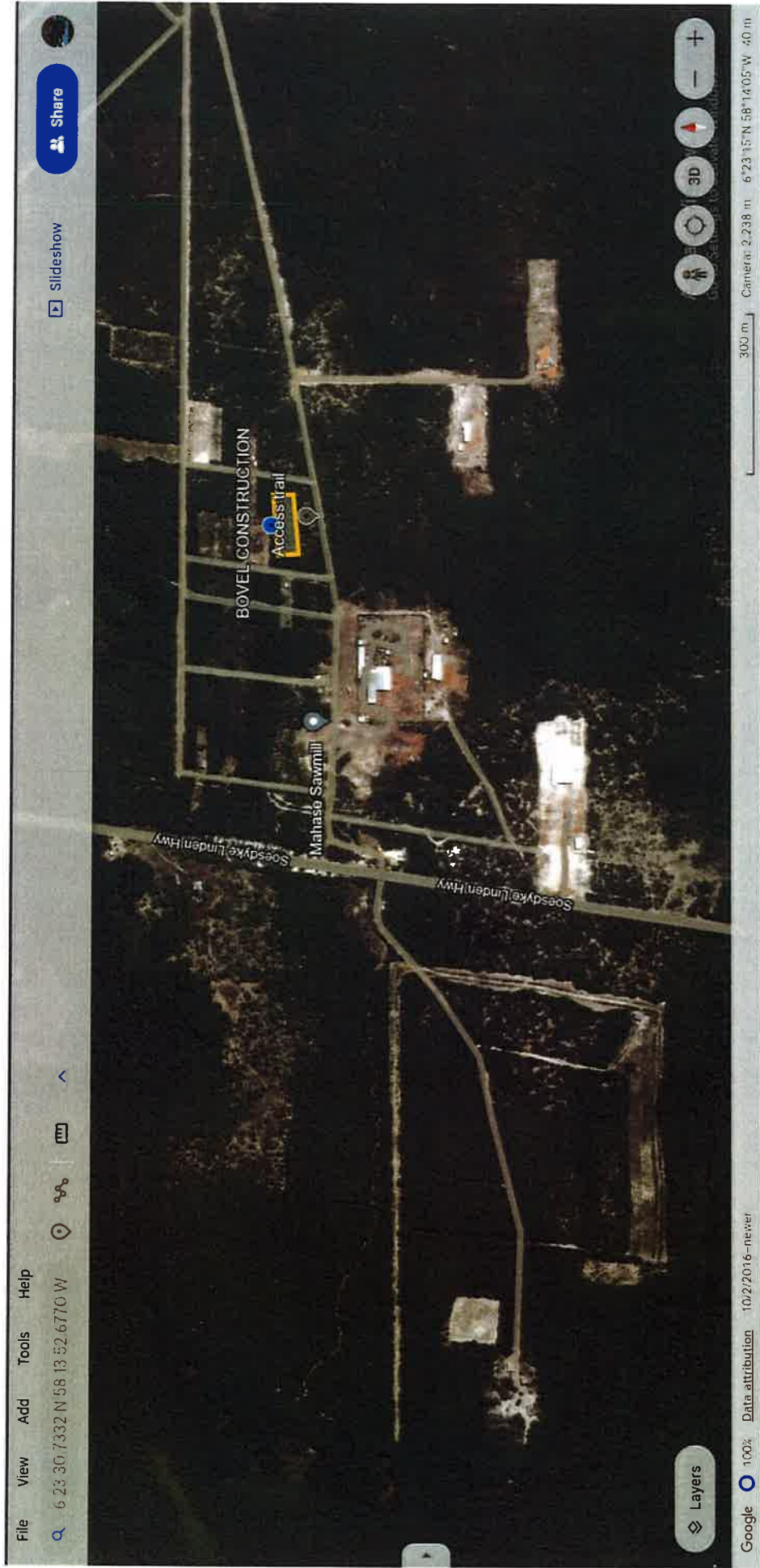
Figure 2: Showing the location of the proposed sawmill site with the sand trail and the surrounding land uses