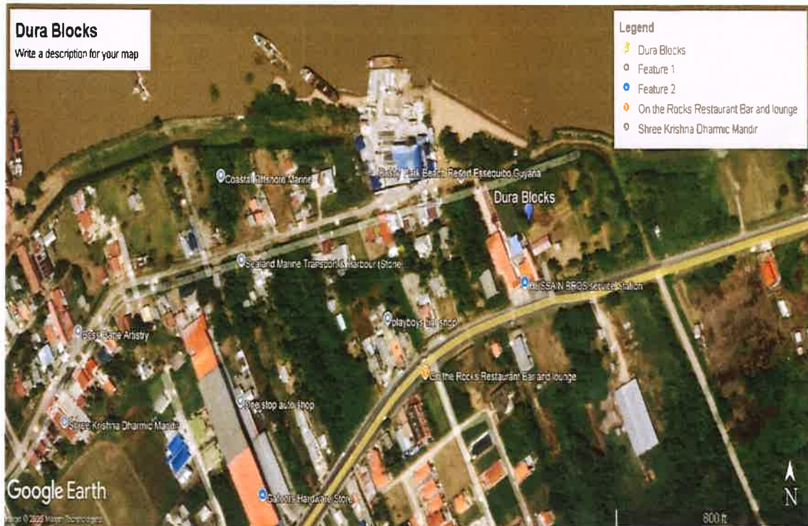
Caption #1: Showing a Google Satellite image of the Facility's location