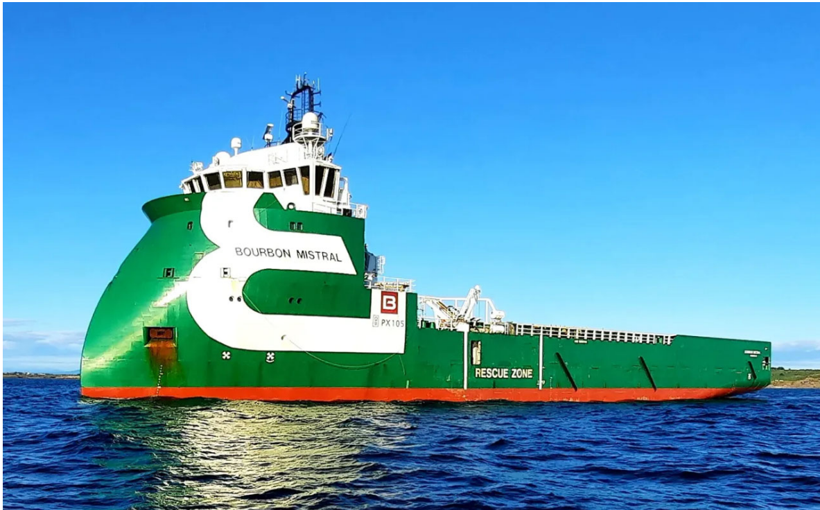
Figure 3 – Bourbon MISTRAL

Specs of these individual vessels has been provided to EPA in our applications.