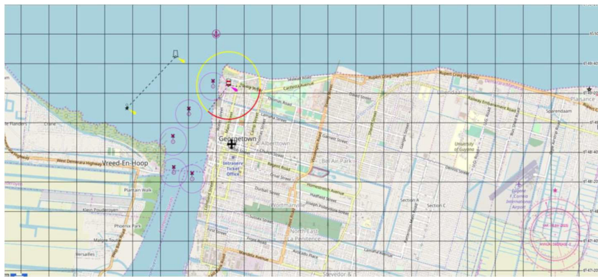
Figure 1 Project Schematic - Georgetown

In this respect Esso Exploration and Production Guyana Limited (EEPGL) and their Contractor Saipem Guyana Inc has requested Bourbon Guyana Inc to provide Offshore Support Vessels to support their Construction Projects ongoing at the projects.