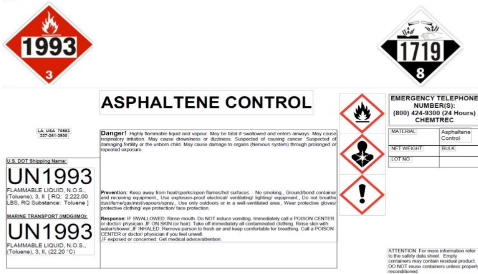
Figure 2: Example of Label