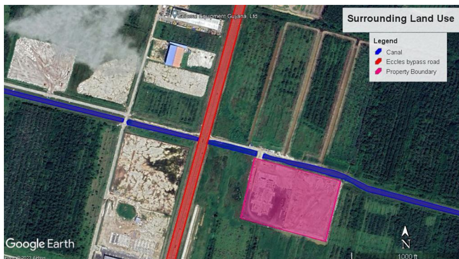
Figure 1: BWS Facility Location

Figure 1 provides an overview of the property location.